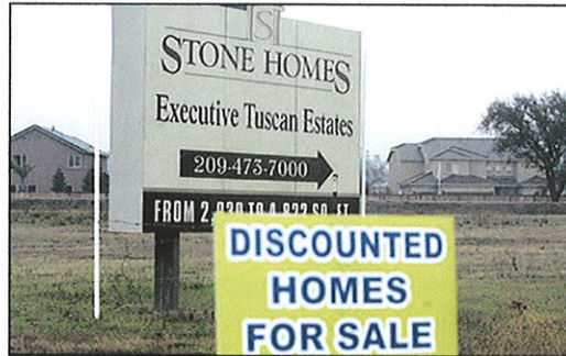
Rapidly changing mortgage rates add to the confusion in home sales.

In the words of more than one mortgage broker, fluctuating interest rates on traditional fixed-rate home loans have been "crazy" this week.